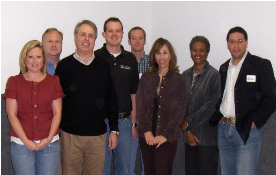
Pictured above: FBLC volunteer lawyers at a clinic earlier this year

The 2009 statistics show that just over 8% of the population of Fort Bend County lives at or below the poverty line; that's nearly 40,000 potential clients who have civil legal needs, but limited access to legal assistance. We are improving our delivery methods and enhancing our services. We need your help to continue to reach those who need pro bono assistance.